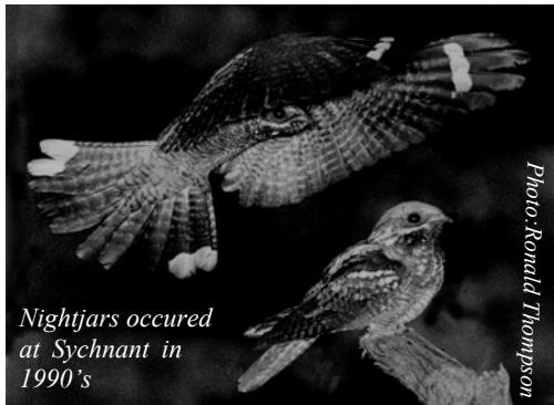
Nightjars ocured at Sychnant in 1990's